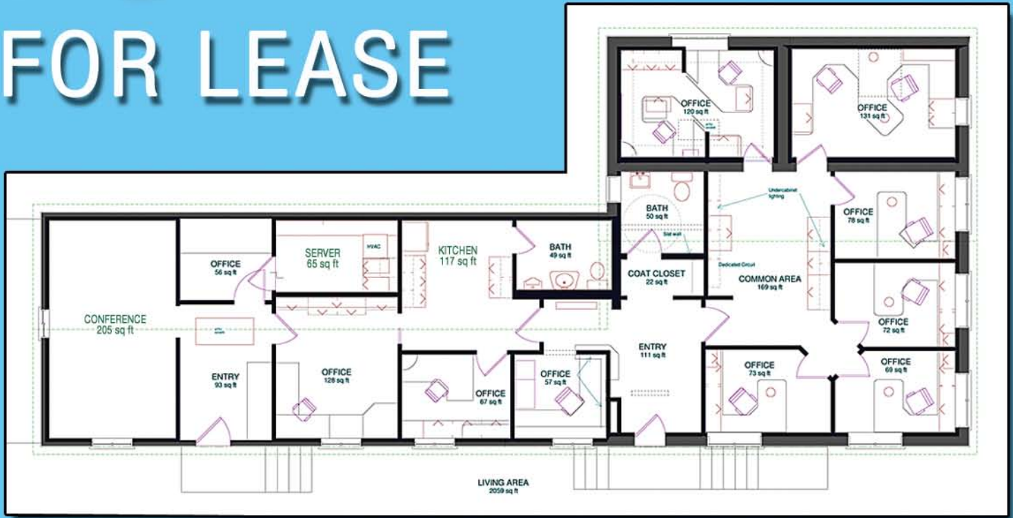
Main Building 2,102 s.f. Finished Space